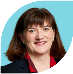
The Rt Hon Baroness Nicky Morgan

At every stage of the journey, from pre-school to retirement, we are gaining valuable knowledge, skills and experience that are essential to life. Lifelong learning opens up new opportunities, helps create more personal fulfilment, and enables us to play our part in a thriving economy.